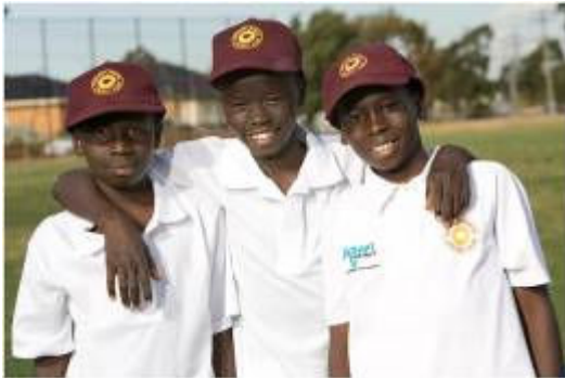
Sunshine Heights cricket Club