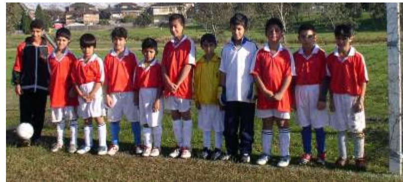
Victorian Iraqi Soccer Club