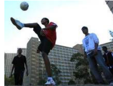
Arsenal International Soccer Festival